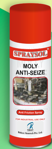
LUBRICANTS & ANTI-SEIZE