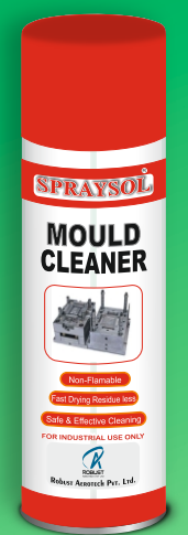
CLEANER & DEGREASER