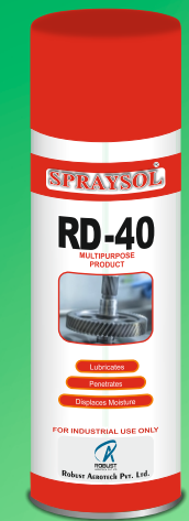
RUST REMOVER & PROTECTOR